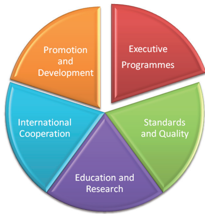
Program Areas – there are 5 program areas

At the 2011 Occupational Therapy Australia conference, Thelma Burnett, WFOT delegate, presented a paper that outlined the structure of the WFOT. This is the section related to the program areas